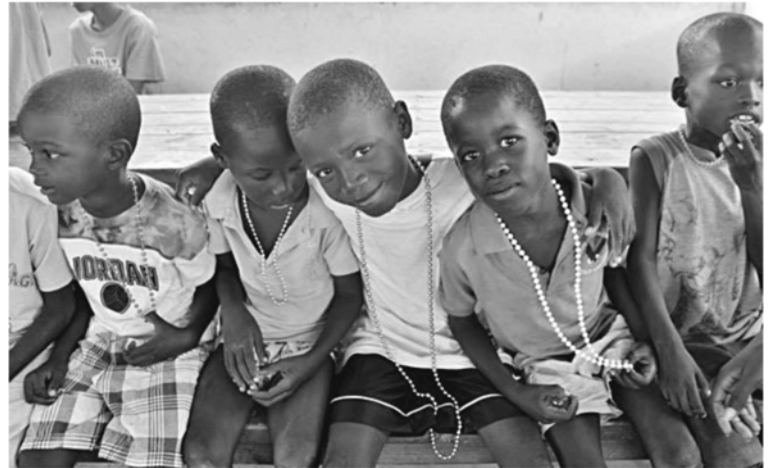
Kids like these will receive backpacks filled with school supplies thanks to the money our All Stars players will raise during VBS this week. You can help too!

We'll keep track of how much cash each team collects each day and let everyone know who's leading. At the end of the week, the team that has