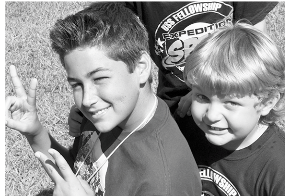
USS Fellowship cadets didn't let Wednesday's power failure stop them from having a great day exploring God's awesome universe. Training aboard their shuttlecraft, singing on the Main Bridge or playing on the realistic outdoor Holodeck — it was "ops normal."